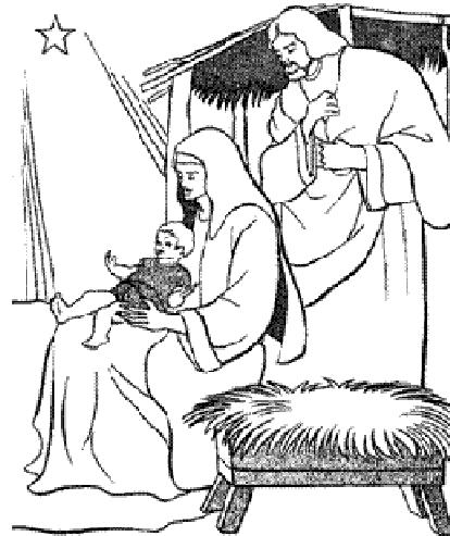
Jesus is Our Reason for the Season